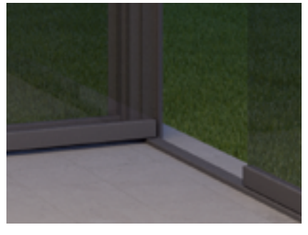
Floor track – barrier-free and functional

Via a steel cable, the stainless-steel turning knob opens and closes the locking bolts in the upper and lower door rail of the first door panels. The turning knob comes in a one-sided or two-sided version. In addition to the standard stainless-steel version, the turning knob can also be powder coated in the customer's colour of choice.