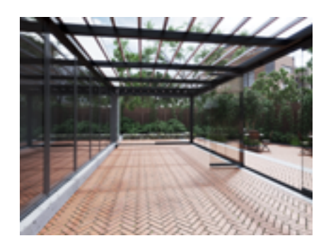
Large openings with double exit

In the parking niche, the system does not need to be released from the floor profile and can therefore be embedded in the floor. This gives the user barrier-free access from inside the home to the outside area. Drainage vents and a condensation gutter lead water back outside.