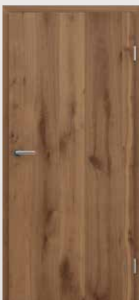
GREENLINE PRESTIGE oak »Alteiche« oiled

GREENLINE PRESTIGE oak »Alteiche« matt lacquered