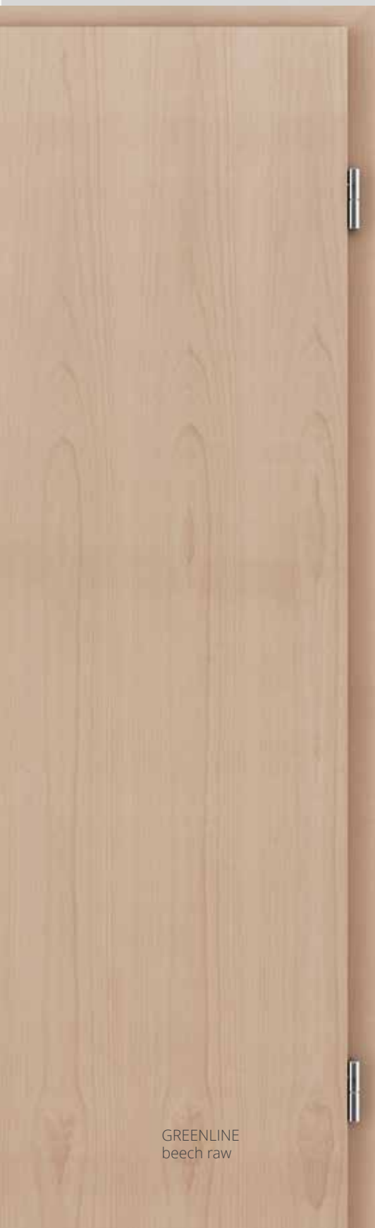
GREENLINE beech raw

A versatile surface made of composed veneer sheets offers a vast variety of colours and patterns.