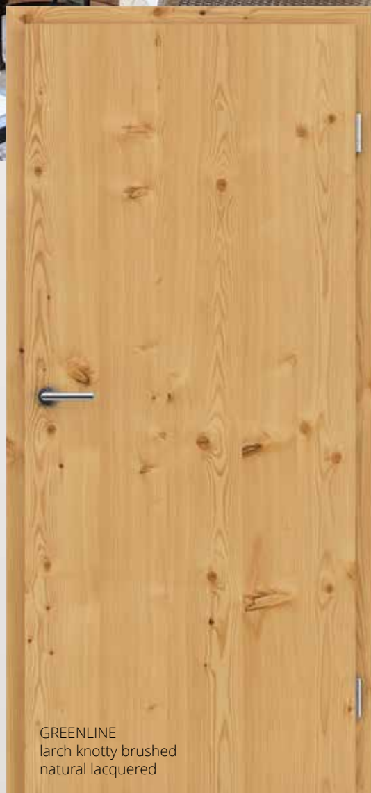
GREENLINE larch knotty brushed natural lacquered

The LARCH tree is the only conifer that loses its needles in the winter. A walk through a larch forest is truly something remarkable. Because the crowns let a lot of light through, such forest is quite bright. That's why the larch veneered door is well suited for bright spaces with contemporary design. Larch wood is dense, heavy and durable, which means that the products we create have guaranteed durability and strength.