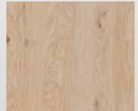
oak knotty brushed white-oiled