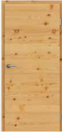
VIVACELINE / F4 larch knotty brushed natural lacquered