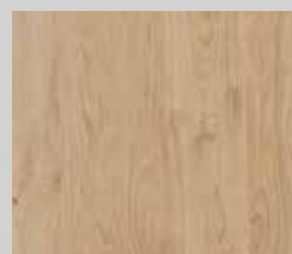
oak knotty matte stained lacquered