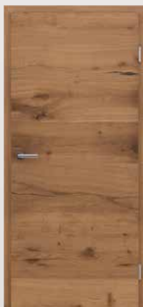
VIVACELINE / F4 PRESTIGE oak »Alteiche« matt lacquered