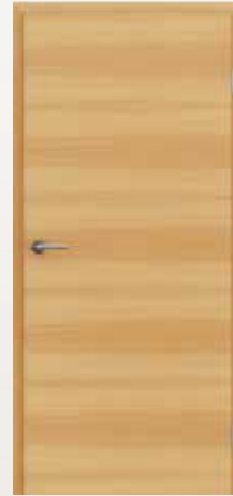
VIVACELINE / F4 larch brushed natural lacquered