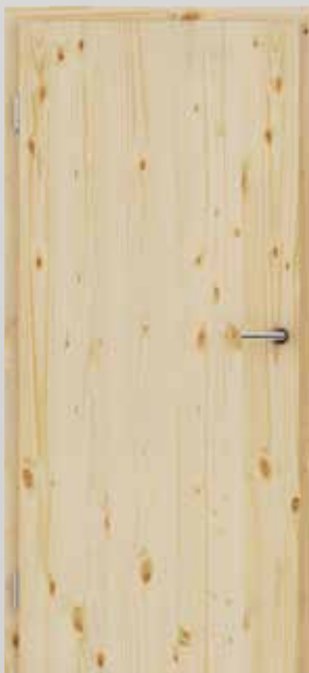
GREENLINE spruce knotty brushed