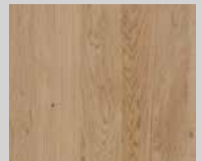
oak knotty natural lacquered