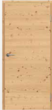
VIVACELINE / F4 larch knotty brushed matte stained