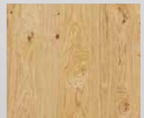
oak knotty oiled