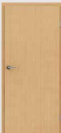
GREENLINE larch brushed matte stained