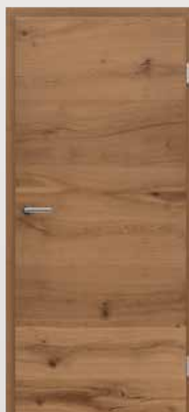
VIVACELINE / F4 PRESTIGE oak »Alteiche« oiled