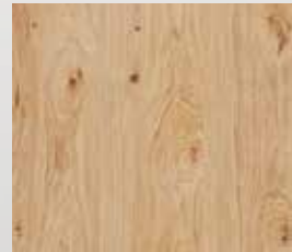
oak knotty brushed natural lacquered