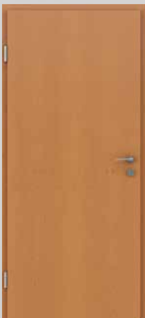
GREENLINE alder tinted