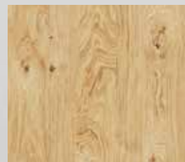
oak knotty brushed oiled