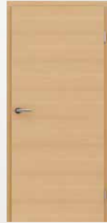
VIVACELINE / F4 larch brushed matte stained

The old folk tradition says that forest fairies used to live in larch forests. It was those fairies who wanted to cheer up the larch when it wished that its needles would dance in the wind like the leaves of other trees. The needles of the larch turned into soft green leaves. It was all well, until the storm came down from the mountains, broke its branches and tore up its leaves. The larch then asked the good fairies to restore its needles. But as a reminder, the larch only received such leaves that turn gilt each autumn, and fall off like the leaves of deciduous trees. Because they love the larch forest, the fairies are said to still live there.